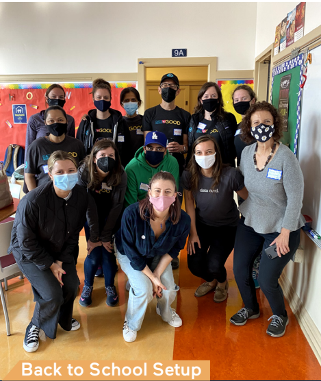
Back to School Setup

New Relic has provided volunteer power and financial support for Guadalupe Elementary School and has become their trusted community partner over the past six year. This year marked the return of in-person learning, and New Relic remained dedicated to Guadalupe’s community, providing resources which made the year easier for not only students, but also staff and administrators.